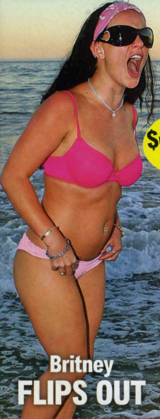
Britney FLIPS OUT