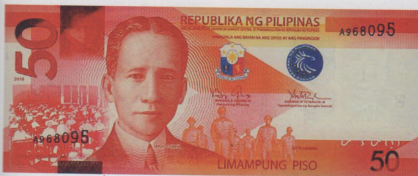
FROMTOP: Pas de Chocolat, Noise Machine #1; Mark Salvatus, Current Affair$ , 2014.

Around the globe, art tourism is a lucrative business, attracting collectors and visitor dollars.